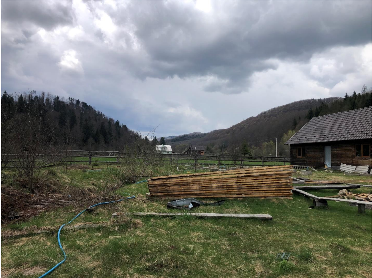
A view across the cove where the camp is situated