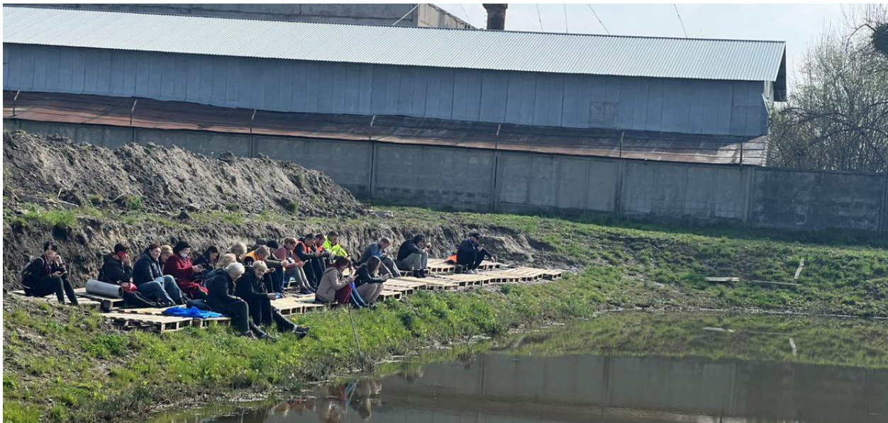
Above. Air raid warnings were a part of working in country. We could either go outside onto a huge parking lot or we could go to the above pictured area far from the warehouse to “relative” safety and there, look out over the wastewater pond where the area had been prepared to provide pallets and a place to sit.

Ukraine Missions A Ministry of the Hardin Valley Church of Christ 11515 Hardin Valley Road Knoxville, TN 37932