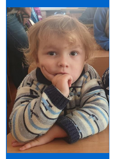
This is one of the children in the shelter where we took hygiene & medical supplies.