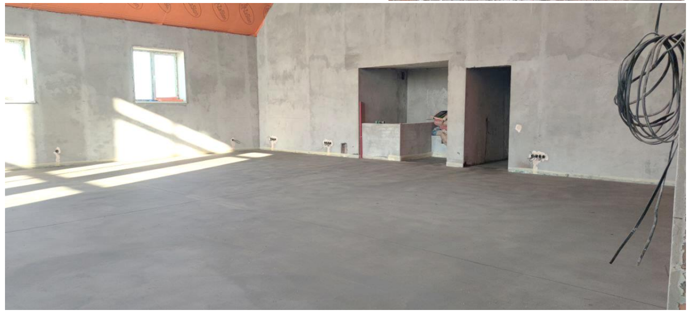
Our auditorium is prepped to be overlayed with tile.

The Boiler install preparation required a great amount of work. The men of the congregation did all of the work themselves! The slideshow records the forming of the concrete pad, the