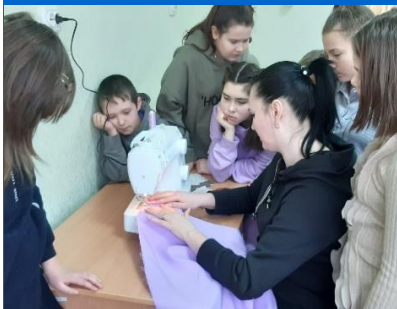
Seamstress/Sewing training in the Svitlovodsk Tuberculosis Orphanage