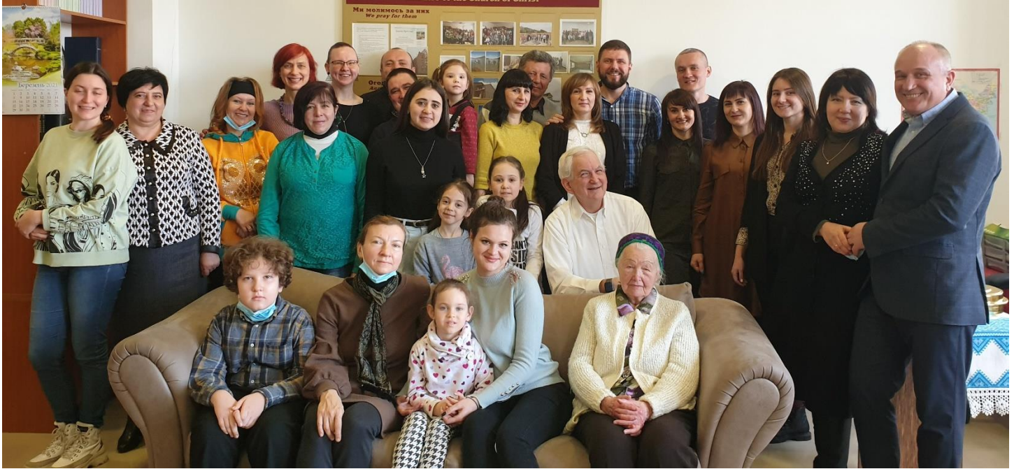
Above Photo: The Church of Christ meeting March 2021 in Ivano-Frankivsk, Ukraine. In addition to this good number there were others that joined in the worship via their phones.

The March 2021 UKRAIBE MISSIONS newsletter is now available. I spent most of the month in Ukraine. But while I was in Ukraine a number of activities continued in Searcy, AR, Holly Spring, MS, Columbia, TN and Montgomery, AL. In Montgomery there were several eager groups that made the warehouse beehive buzz with activity! Here are a few photos: