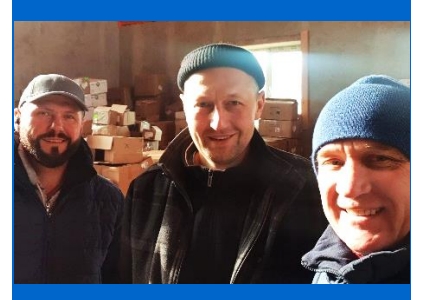
We have had classes with some large families and orphans in the country. 32 children received food, toys and clothes.