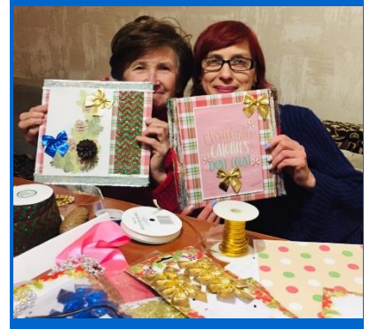
"Our ladies gathering...we meet once a month and spending time together praying, doing some crafts and sharing what we have on our hearts. This inspires us to serve each other and other people."