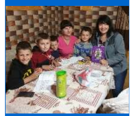
Children's Bible Class in Village Zelena!