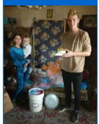
"We thank you so much for Family Buckets with aid. We thank all brethren that put them together and ship to Ukraine. They are such a great help especially now when our country is facing so many problems. People and their children are so happy to receive aid that words fail to describe their joy. They cannot believe the aid is free and that there are true Christians who give such good things to people they have never met."