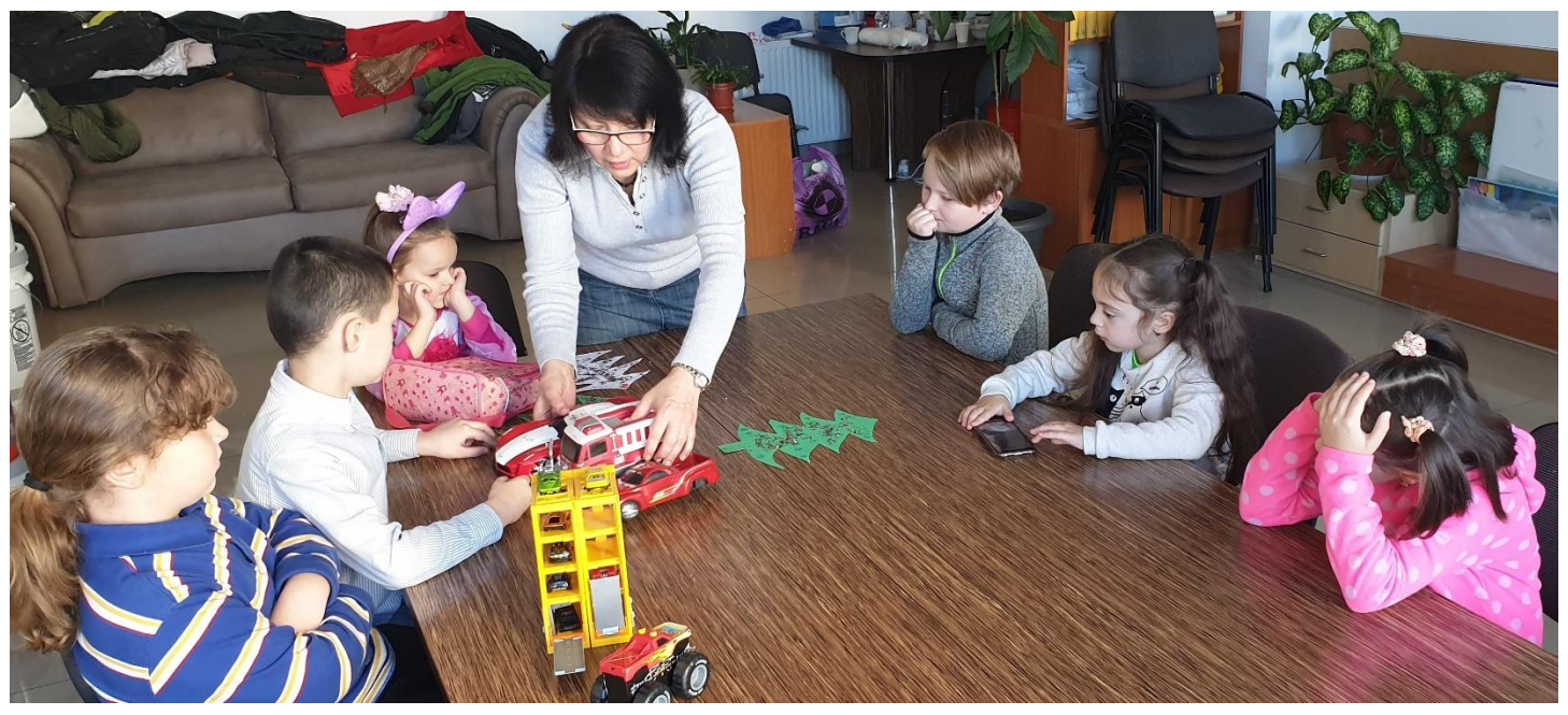
Photo: Children's Bible Class in Ivano-Frankivsk enjoy pre-class activities before the class begins!