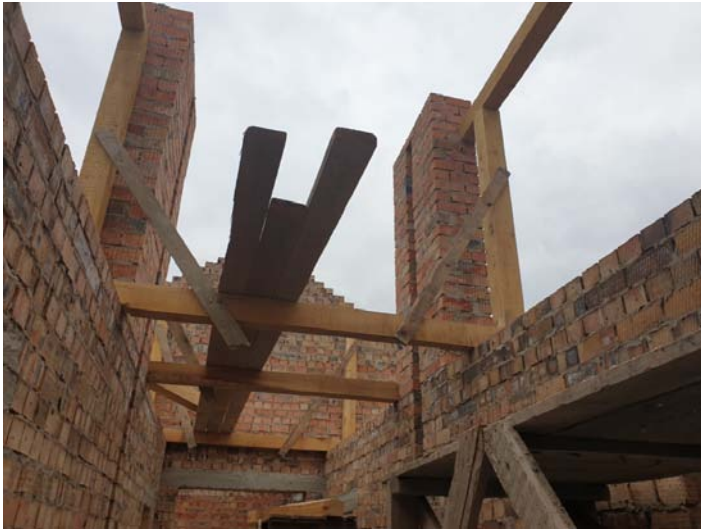
Beams and frames being set into place!