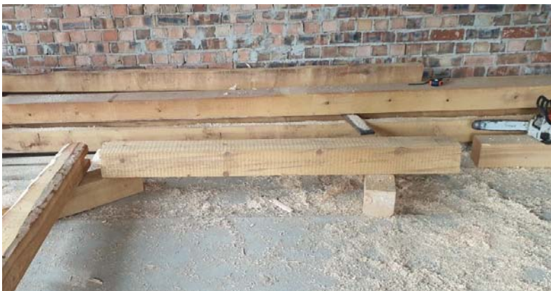
Tongue & groove with a chainsaw and tape measure!

Продолжается стройка, вчера начали устанавливать деревянные балки для крепления крыши. Construction is going on. They started putting up wooden beams for the roof yesterday.