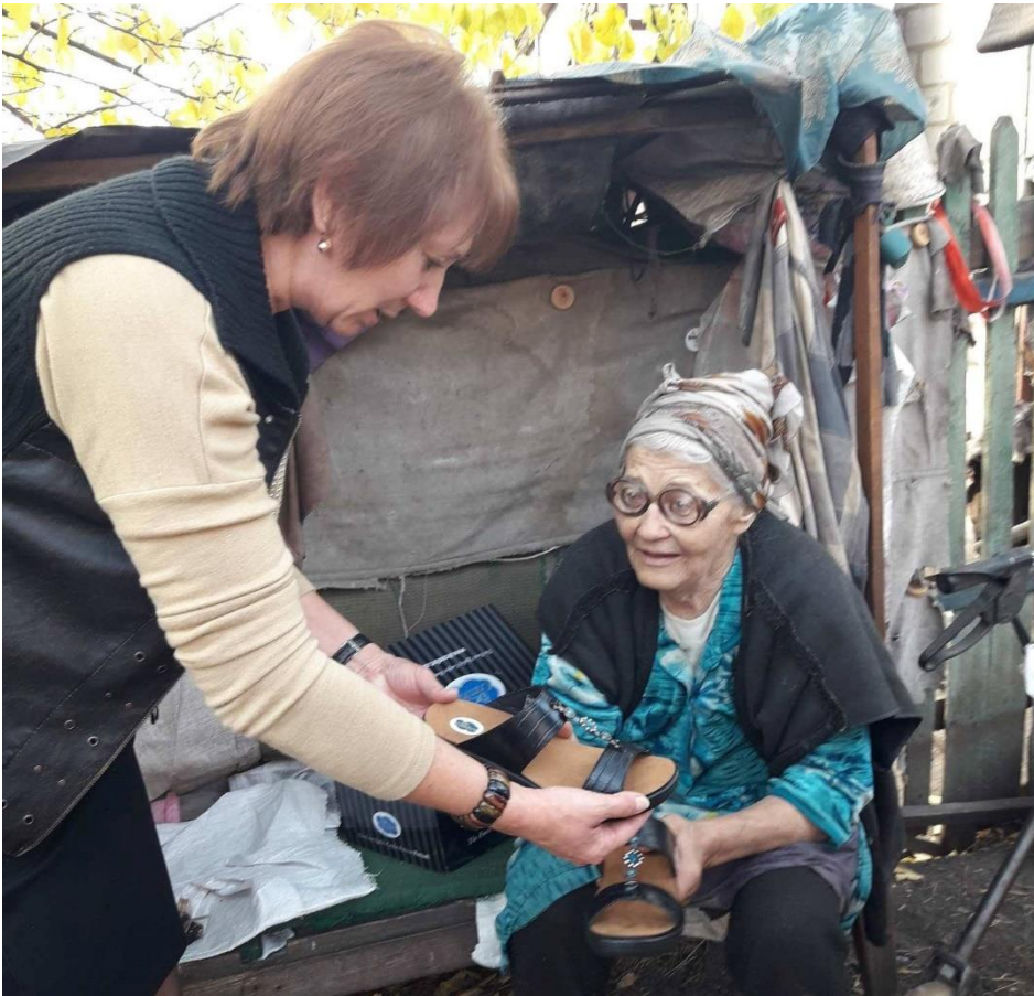
Photo: In the midst of the horrors of Russia's invasion and occupations of small parts of Eastern Ukraine, we shipped in a container of shoes that were distributed to those in greatest need. Thanks to the Union of Paratroopers of Ukraine and Association of Paratrooper Veterans of the Vinnytsia Region we were provided the essential military escorts and assistance in this distribution. "Almost 3,500 of citizens of Donbass want to thank you for the aid. These are towns of Zaitseve, Mayorsk, Bakhmutka of Bakhmutka District and the town of Luhanske of Svitlodarsk District in the Donetsk Region."