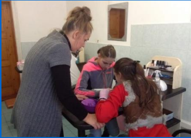
The girls are learning manicure and pedicure procedures!

Jerry visited with select orphanages and made assessment studies of what employable vocations are practical for that portion of Ukraine.