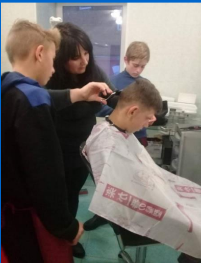
The boys are being trained as barbers.