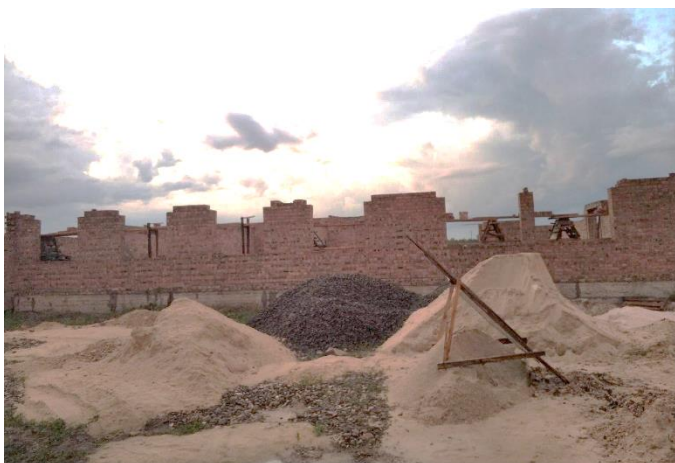
This day has ended and we are even closer to the goal!

"Dear brethren, we need your support badly so that the work won't be suspended and we won't lose our workers. We have saved almost $20,000.00 on our efforts. This is all that we could do, it is still necessary to put half a meter of brick around the perimeter, make concrete lintels above the windows and put the slabs of the first floor. To finish this stage, we need $39,000 ($17,000 to finish walls. But to finish walls we need intermediate floor slabs. Price for this is $22,000). Then we'll put the roof. We try to do everything we can to make construction cheaper, we help builders. With brothers we bring and unload cement, wood, rebar. Now prices have risen again. Andrew says that all prices have increased by 15%. It's good we bought bricks for the entire building. Brothers and sisters, please pray for us that the Lord would help us finish the construction of the church building and we could move to a new building. Thank you for your help and unity in Christ. Big thanks to all of you. May we always bring glory to our Lord with our deeds and faith."