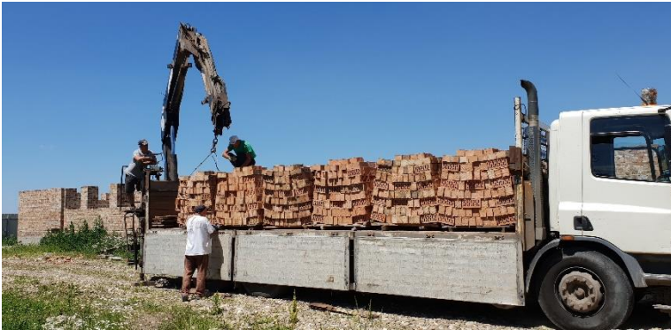
We ordered more bricks and they were delivered today!