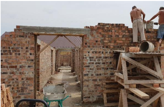
Walls as of 12 June