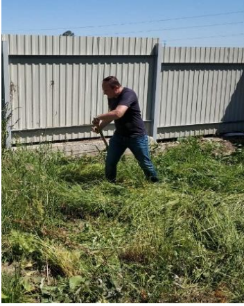
Cutting grass as our fathers and grandfathers did!