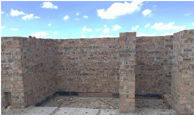
This is the baptistry in development!