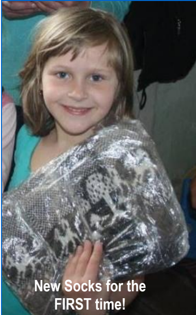
New Socks for the FIRST time!

“We continue distributing humanitarian aid to people. We constantly give out clothes and food that you send us. I wish you could hear the words of gratitude addressed to you and to our Lord for the aid people receive from us. Joy in their eyes motivate us to work harder.”