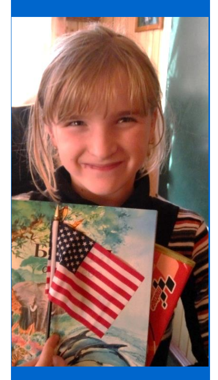
"We have made good friends with the new Director of the children's home he is friendly to church of Christ and we give out Bibles and discuss religious topics."