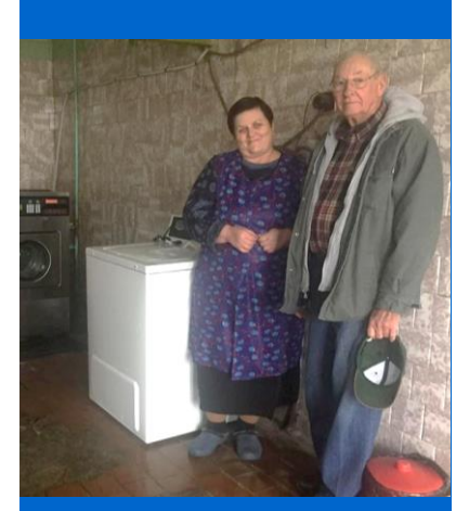
A new clothes washer was shipped for the hospital