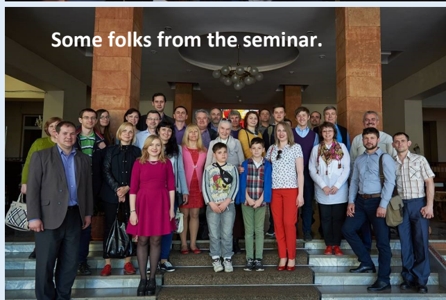
Some folks from the seminar.