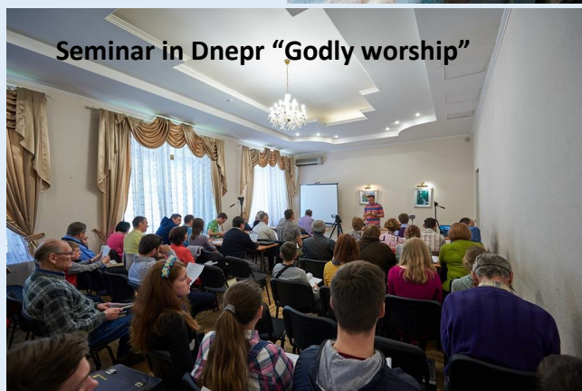
Seminar in Dnepr "Godly worship"