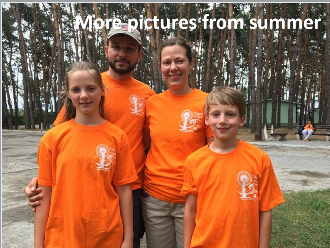
More pictures from summer