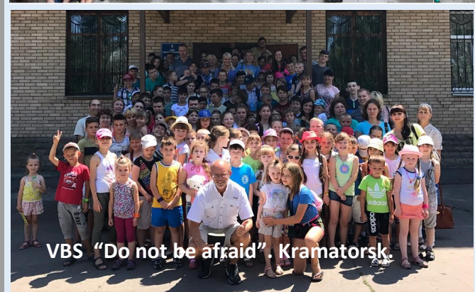
VBS "Do not be afraid". Kramatorsk.