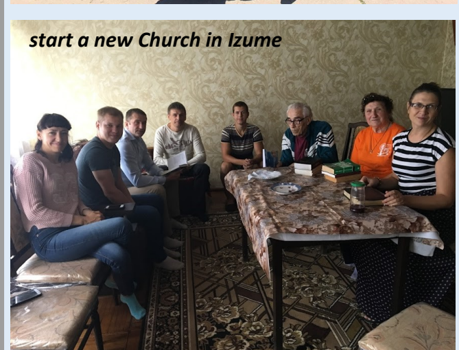
start a new Church in Izume