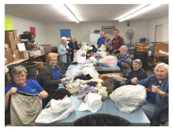
couragement to our efforts!

The activities scheduled for the Harding Place retirement center in Searcy, AR have included morning trips to the warehouse in Judsonia, AR to sort clothes, toys and shoes. In April the group came on 24 April and spent the morning in our sorting room. They were a delightful and productive group. Many in the group have been previously involved in various aspects of our ministry. They are a wonderful en-