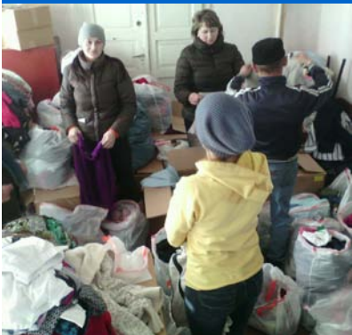
Those displaced by Russia's invasion and occupation in the east come to get clothing, food and personal hygiene items.