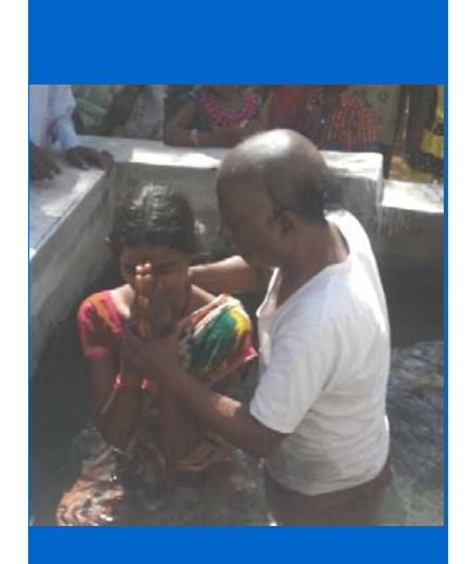
"Greetings in the merciful name of our Lord and Savior Jesus Christ!

Sir, I and the preachers here thank you again for your love and kind alms.