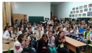
Ninth-graders final Jopardy and performance