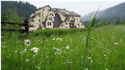
Church Retreat Site