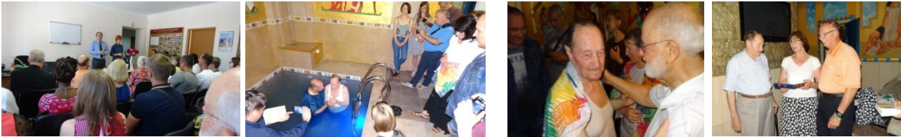
Worship with Ivano -Frankivsk Church of Christ