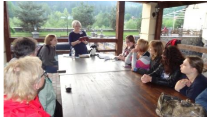
Ladies Class at Church Retreat