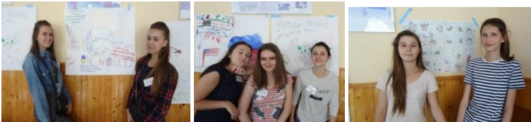
Poster presentations "Fruit of the Spirit in our lives"