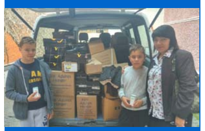
Shoes and Food mixes being distributed to an orphanage in western Ukraine