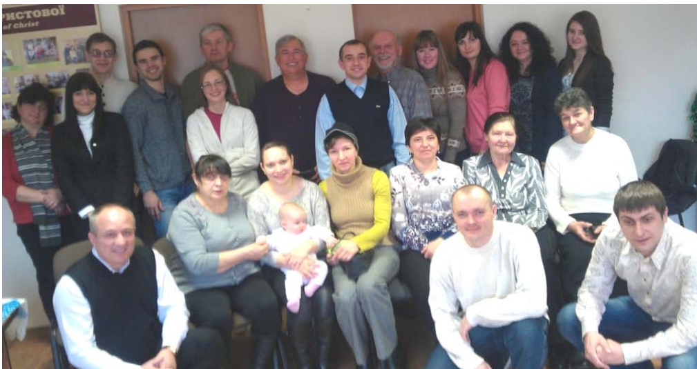
The church of Christ in Ivano-Frankivsk—February 2015

"I greet you from Ivano-Frankivsk and send you greetings on behalf of the local church of Christ and my family. I thank God and you for support, prayers and care for us. It encourages and inspires me in times of confrontation and the uncertainty of this country's future. Thank you that you have not abandoned us but have supported us in unity of spirit in your prayers."