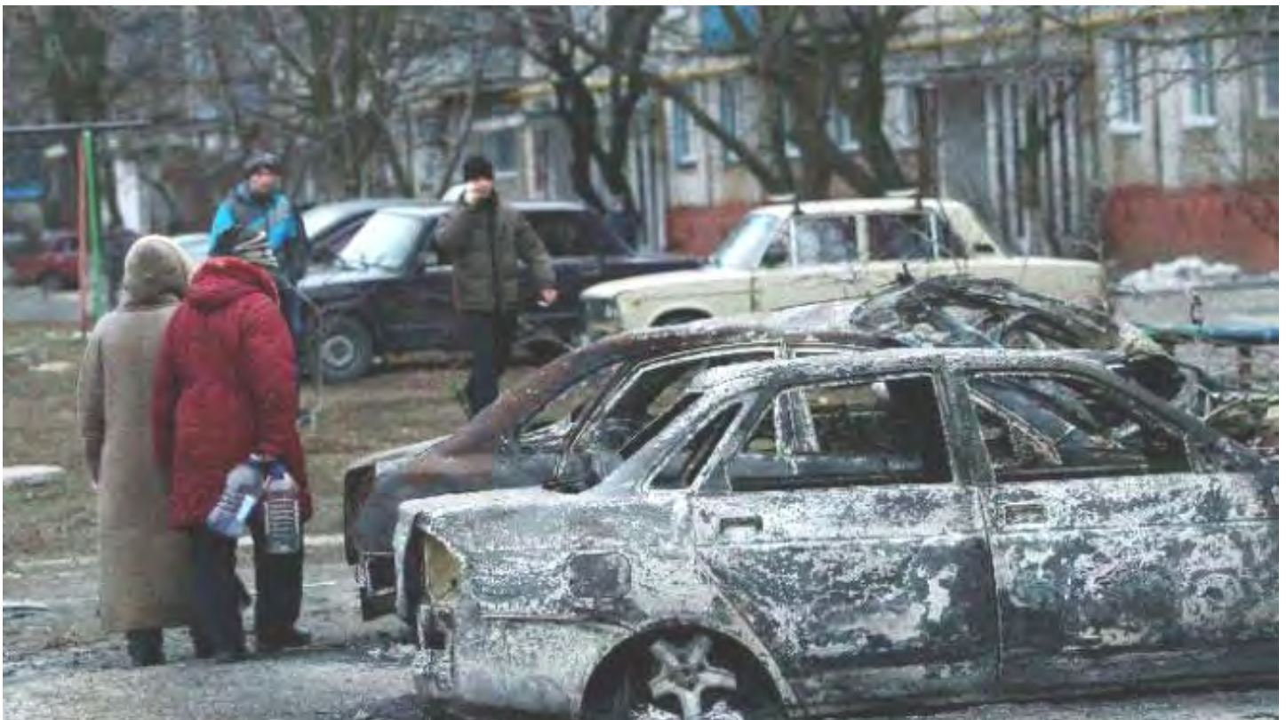
People look at burned out cars as they walk along a street in the southern Ukrainian city of Mariupol on January 25, 2015 a day after a rocket barrage blamed on Kremlin-backed Ukrainian rebels killed 30 in the city

United Nations (United States) (AFP) - A rocket attack on the Ukrainian city of Mariupol that killed 30 people at the weekend deliberately targeted civilians and the perpetrators must be brought to justice, a senior UN official said Monday.